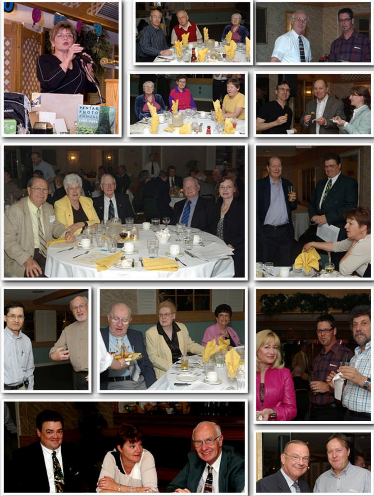
Banquet 2007