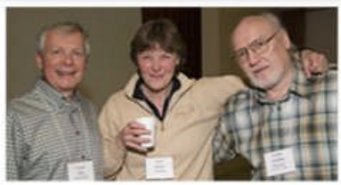
Various Meeting Events