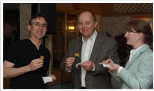
Banquet 2007