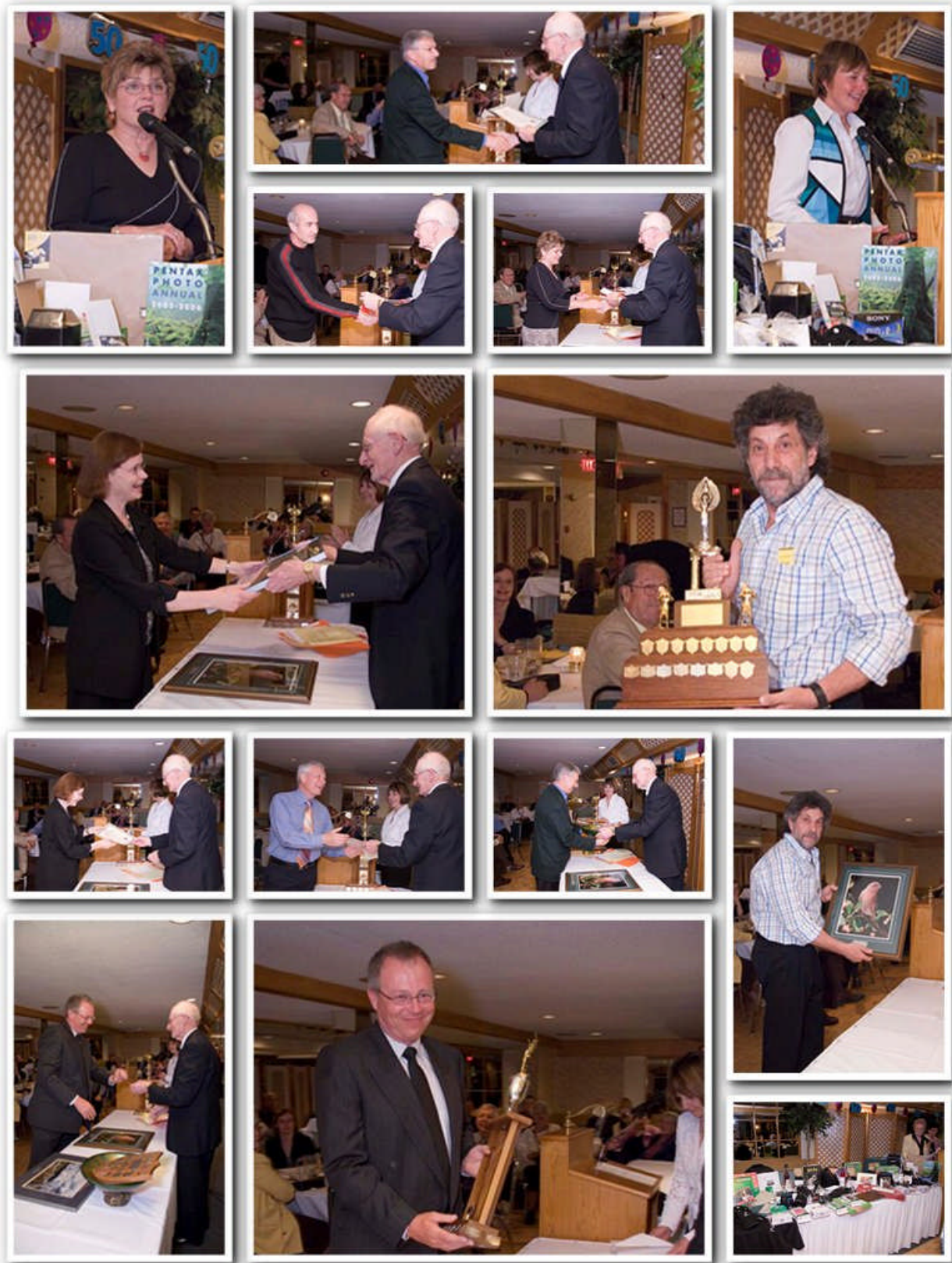
Banquet 2007 Awards