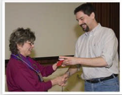
Ribbon Award Ceremonies